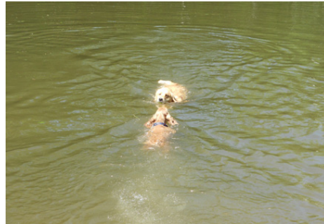
Making a new friend